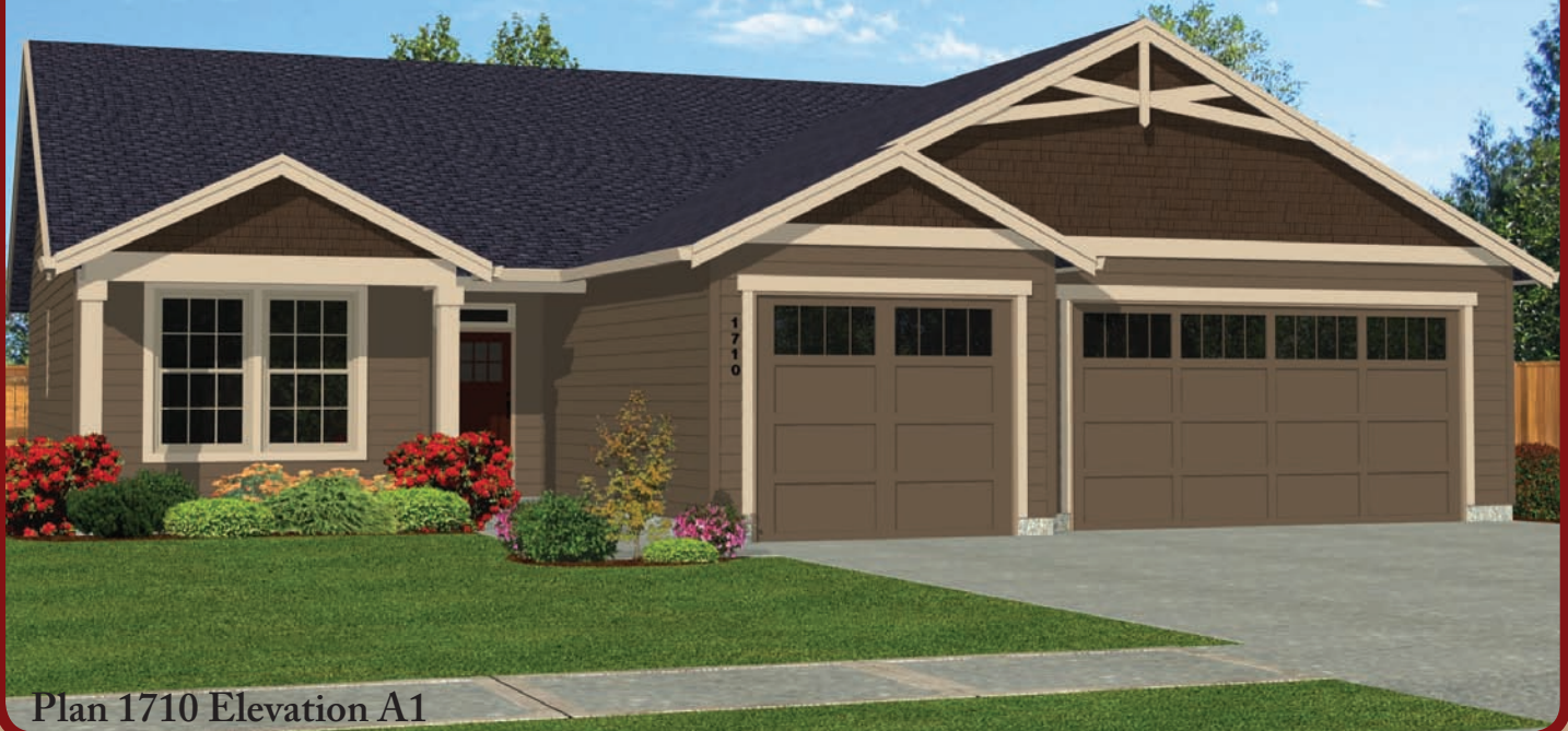
Plan 1710 Elevation A1