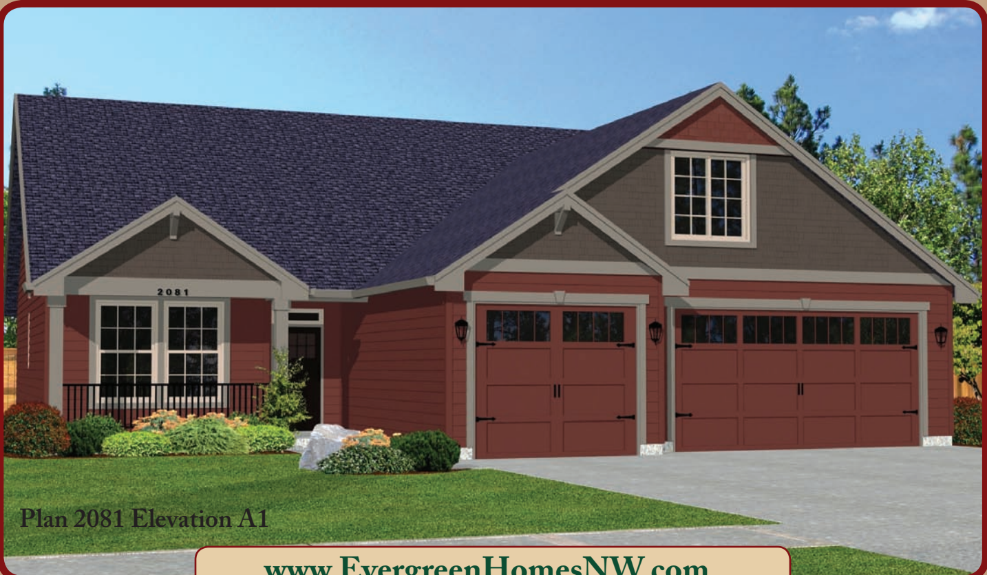
Plan 2081 Elevation A1