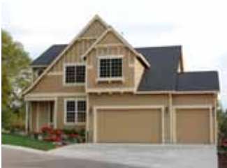
Plan 2398 SF 4BR/2.5BA Starting at $319,000