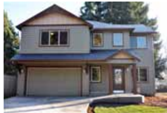
Plan 1584 SF 3BR/2.5BA Starting at $279,900