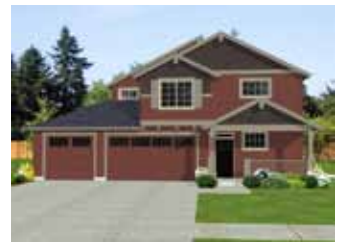
Plan 2104 SF 3BR/2.5BA Starting at $309,000