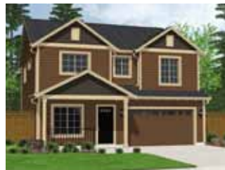
Plan 1942 SF 4BR/2.5BA Starting at $289,900