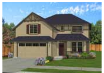
Plan 2581 SF 4BR/2.5BA Starting at $325,900