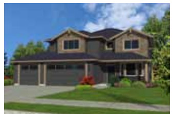
Plan 3163 SF 4BR/3.5BA Starting at $359,900

Contact Tama Sundstrom Ph: (360) 624-5145 | Fax: (360) 574-6850