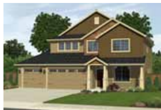
Plan 2780 SF 5BR/3.5BA Starting at $336,900