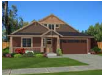
Plan 2403 SF 3BR/2.5BA Starting at $316,500