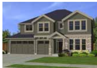
Plan 3085 SF 5BR/2.5BA Starting at $353,500