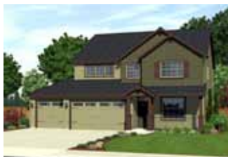
Plan 2701 SF 4BR/2.5BA Starting at $335,900