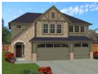
Plan 2533 SF 4BR/2.5BA Starting at $327,900