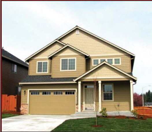
SOLD, Lot #4: 4308 NE 101st St. Vancouver, WA 98686

Convenience in a pastoral setting, Sherwood Place is located across the road from the future 7.7 acre Lalonde's Park and a few minutes to I-205 and I-5, shopping, and restaurants. It's a pretty neighborhood of both new and established homes, and the peaceful feeling is accentuated by the natural beauty of the surrounding grand fir trees. You'll be glad you chose to build your new home here.